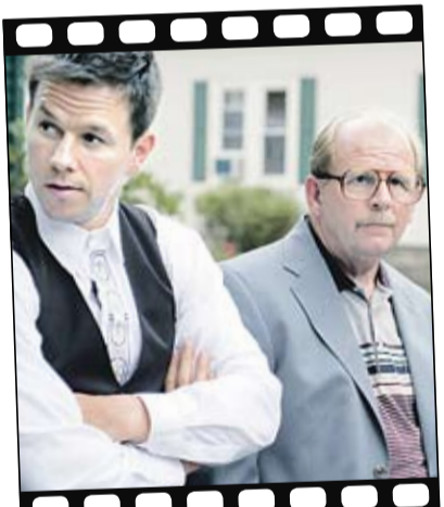
THE FIGHTER: Wahlberg and O'Keefe