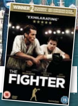
THE Fighter is released on DVD and Blu-ray tomorrow from Momentum Pictures.

LOCATION LOCATION LOCATION: Boston is the backdrop for a raft of hit films