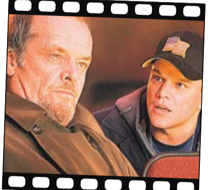
THE DEPARTED: Nicholson and Damon