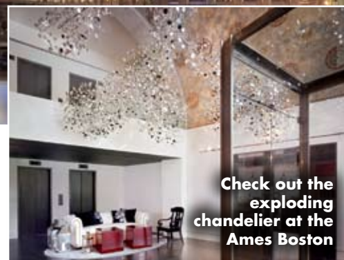
Check out the exploding chandelier at the Ames Boston

Last year the hotel held a series of intimate gigs with musicians including Marina & The Diamonds, Courtney Love and Florence And The Machine.