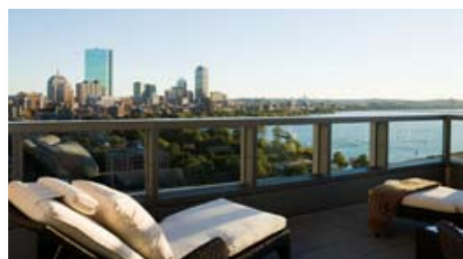
Above: The roof of the Liberty is great for sunbathing and views of Boston (main). Top right: Boston-born Ben Affleck and his wife Jennifer Garner at a Red Sox game

For panoramic city views take the lift up to the Observatory floor of the John Hancock Tower or head to the Skywalk on the 50th floor of the Prudential Center shopping mall. History lovers should follow the 2.5 mile Freedom Trail (start on Tremont Street by the Visitors Centre), marked by a red line on the pavement, which leads you around the 16 landmarks that recall the struggle for American independence. Thrillseekers should hop aboard the wild, wet and noisy speedboat Codzilla tour ( www.bostonharborcruises.com ) around Boston Harbour. If you prefer terra firma, sign up for the Boston Movie Walking Tour ( www.bostonmovietours.net ), which takes in 30-odd city movie locations.