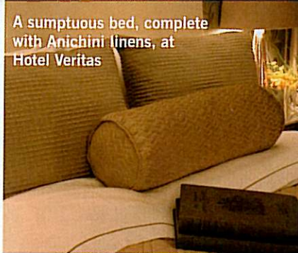
A sumptuous bed, complete with Anichini linens, at Hotel Veritas

independent hotel is a reconstruction of a private residence (circa 1880s) and stables that stood on the site. The feel is old-school New England elegance—brocade fabrics, detailed molding and woodwork, 13-foot windows and a limestone lobby floor reclaimed from a French chateau—meets cool Cantabrigian vibe. There's free wireless, of course, and flat-screen high-def TVs in guest rooms, along with fresh flowers, custom Anichini bed linens and robes, and Etro bath amenities.