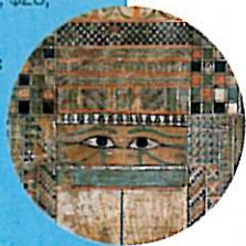
MUSEUM OF FINE ARTS, BOSTON

Toast the 21st anniversary of the Boston Wine Festival , the nation's oldest wine and food series, at the Boston Harbor Hotel at Rowes Wharf, Jan. 8 through April 2. (bostonwinefestival.net; $145)